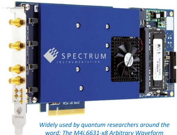
Widely used by quantum researchers around the world: The M4i.6631-x8 Arbitrary Waveform Generator with 1.25 GS/s sampling speed, 16-bit resolution and 2 channels

Individual Ytterbium atoms are suspended in a vacuum in a Rydberg state using optical tweezers. The Rymax collaboration specifically focuses on quantum optimization problems, such as the Maximum Independent Set problem, and algorithms such QAOA or quantum annealing to find solutions. This allows them to build optimized hardware for "analog" quantum computing. One key-aspect of the design is dynamic control over (UV-)laser light, for which full control over the different RF-signals is required. This is where Spectrum Instrumentation's long-standing expertise is valuable.