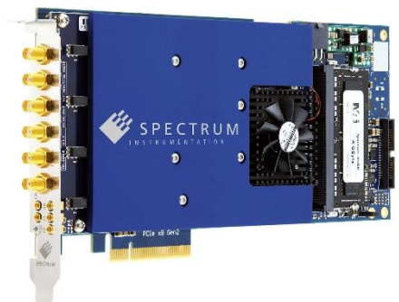
The M4i.2212-x8 PCIe digitizer by Spectrum Instrumentation with 1.25 GS/s sampling speed on 4 channels.