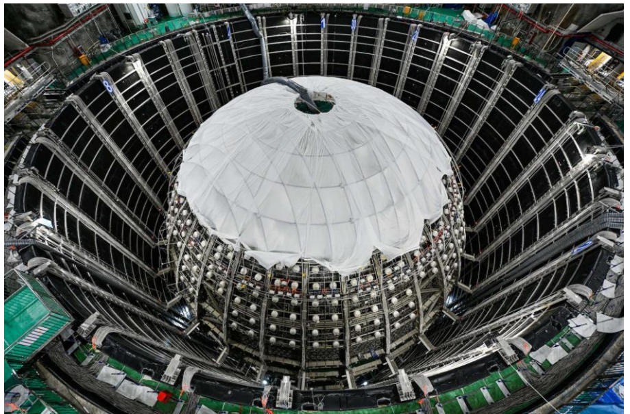
The JUNO main detector 750m underground in a dedicated laboratory. The photo shows the (still empty) water pool of the detector with the central scaffolding. Inside this globe, the acrylic sphere with 34.5m diameter is placed, filled with the liquid scintillator. The white cover just protects sensitive components during mounting.

JUNO is precisely positioned between eight existing nuclear reactors that provide a source of neutrinos for study. At its heart is a gigantic, highly transparent, acrylic sphere with an inner diameter of 34.5 m, filled with 20,000 tons of a specially developed oil-like substance. This liquid scintillator creates photons when a neutrino interacts with it, and it is encased in a large 35,000 tons water pool. The photons are detected by an array of ca. 45,000 photo multiplier tubes (PMTs) that surround the sphere. The teams at the Technical University of Munich (TUM) and at the Johannes Gutenberg University in Mainz are using M4i.2212 digitizer cards by Spectrum Instrumentation in their high-precision, lab-scale experiments to characterize the liquid scintillators, which require advanced data acquisition. When the JUNO detector is commissioned at the end of 2024, it will be the largest, liquid neutrino detector built by mankind. The detector will drastically enhance our knowledge about interactions and properties of these elusive ghost particles.